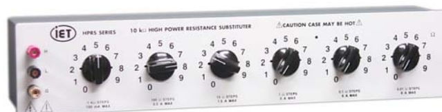
Figure 1.1. HPRS Series High-Power Decade Resistance Substituter

Programmable substituters - IEEE-488 or BCD.